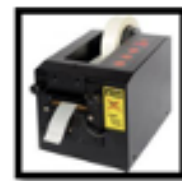
Semi-Automatic Tape Dispenser